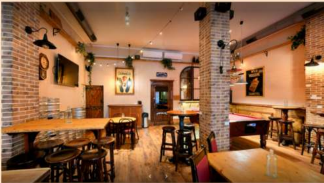
Private Room "Courtyard"