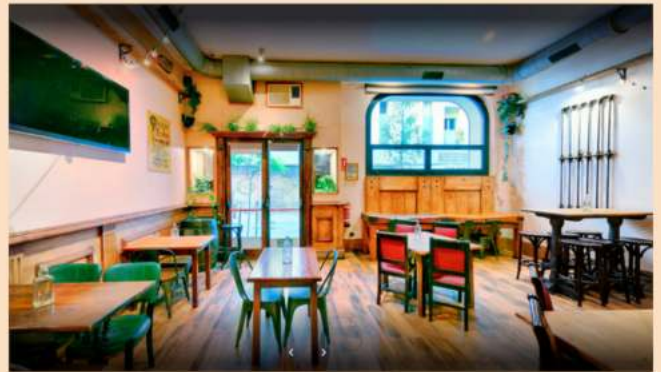
Private Room "Courtyard"