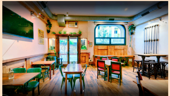
Private Room "Courtyard"