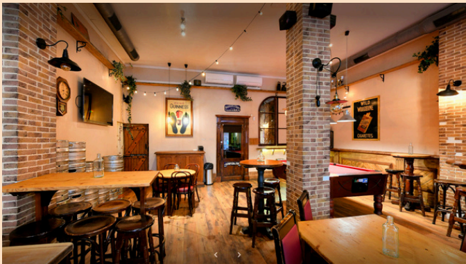
Private Room "Courtyard"